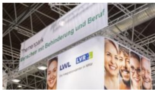
Apprenticeship, workplace and occupation